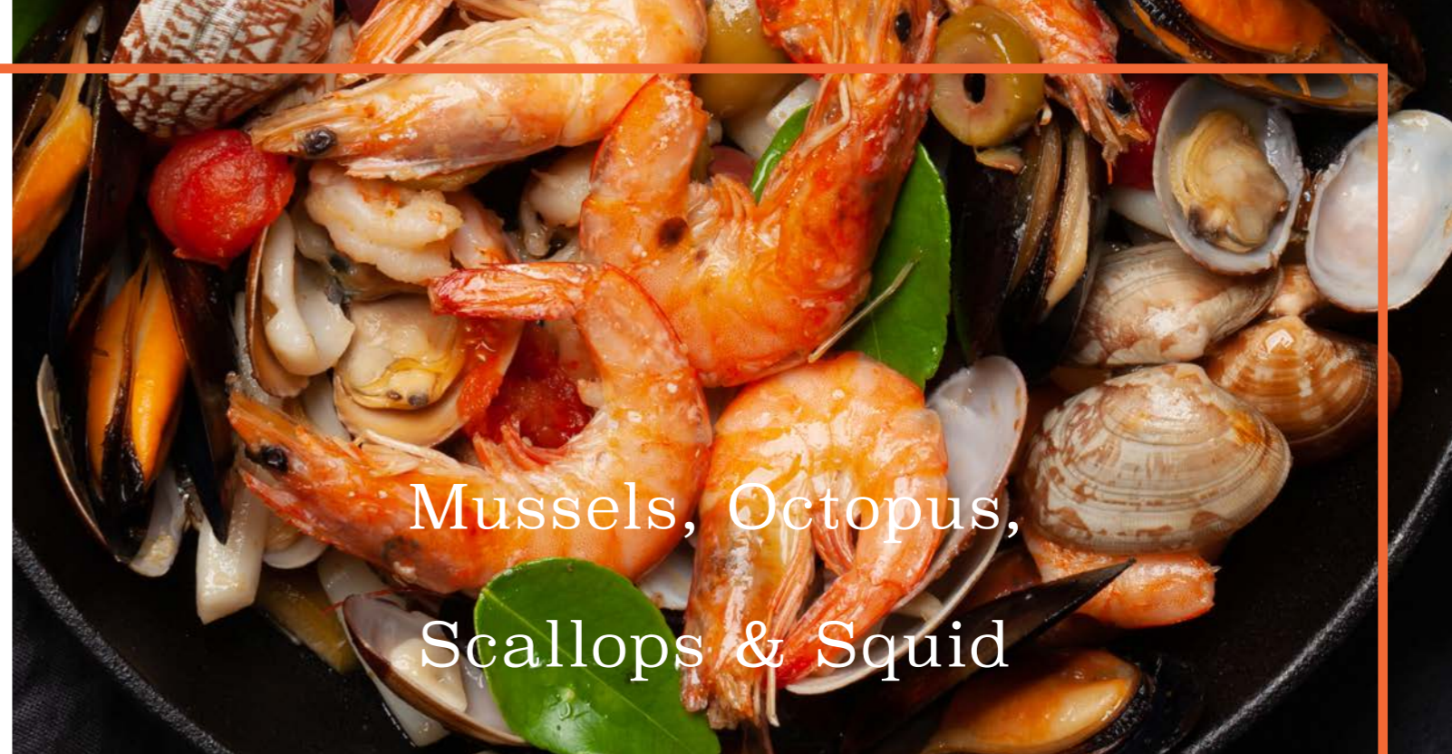
Mussels, Octopus, Scallops & Squid

Pack Size: 1 x 5kg Product Code: 1010100542 Size: Large Product Code: 1010100539 Size: Medium